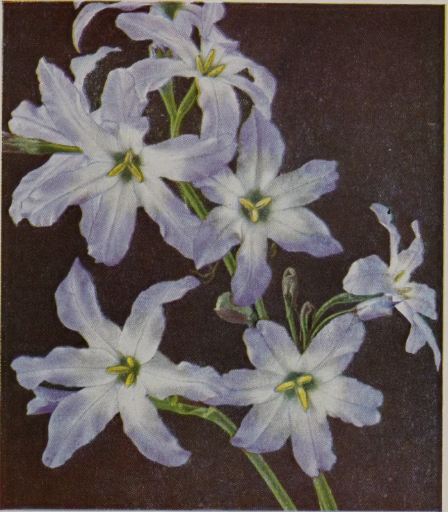
LEUCOCORYNE (Glory of the Sun) See Page 8